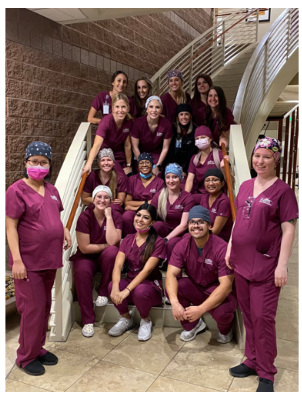
The Mesa Community College dental hygiene class of 2022.