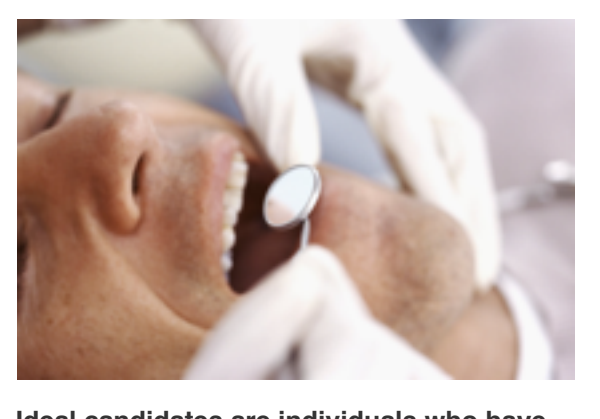
Ideal candidates are individuals who have not received dental health care for three years or longer, suffer from puffy gums or gums that bleed while brushing or eating, or those who have previously diagnosed dental health issues.

Posted Thursday, January 20, 2022 11:10 am